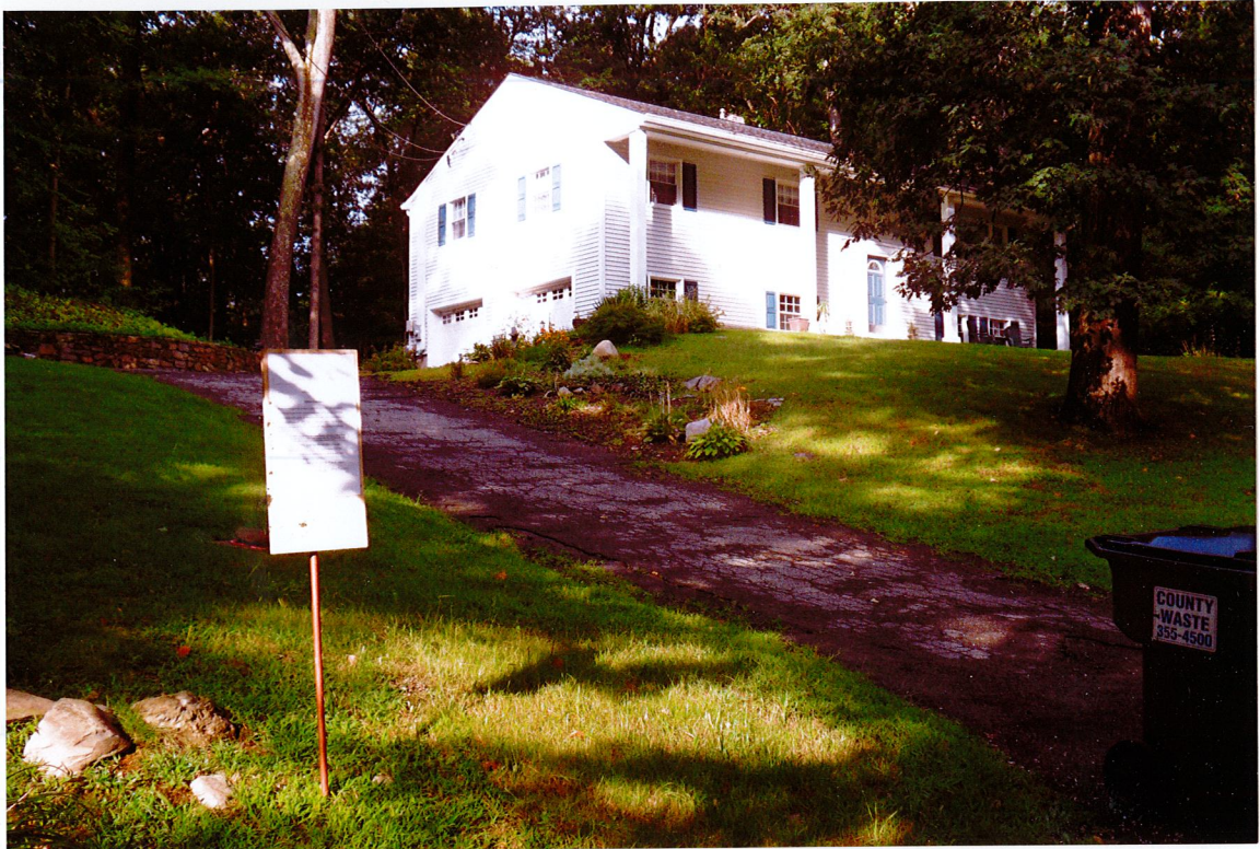
Town Hall, 1496 Route 300, Town of Newburgh, New York, to act upon the following