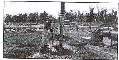
Hydro Excavation in the Oil Industry