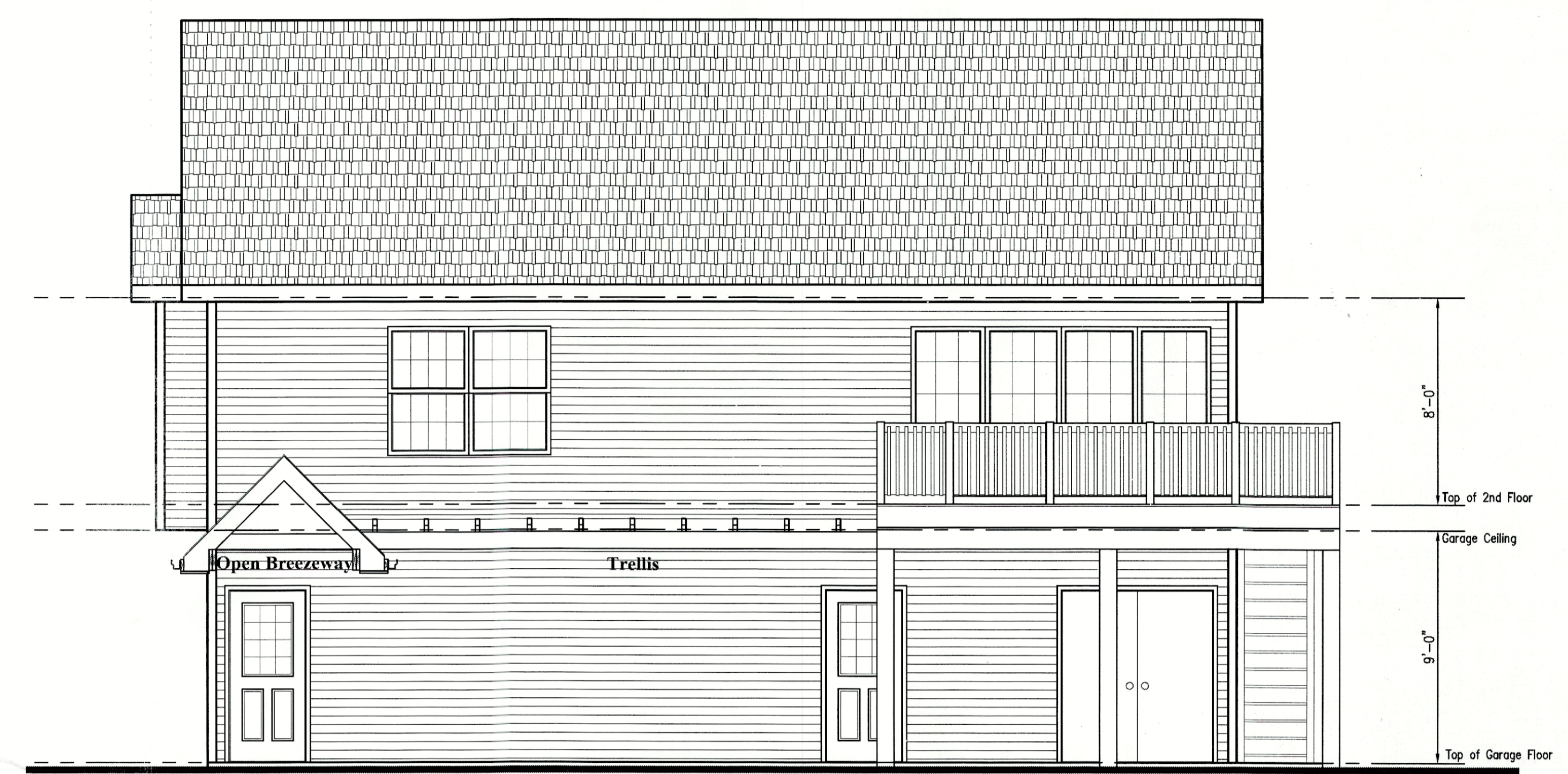
1 Side Elevation A4 Scale: 1/4"=1'-0"