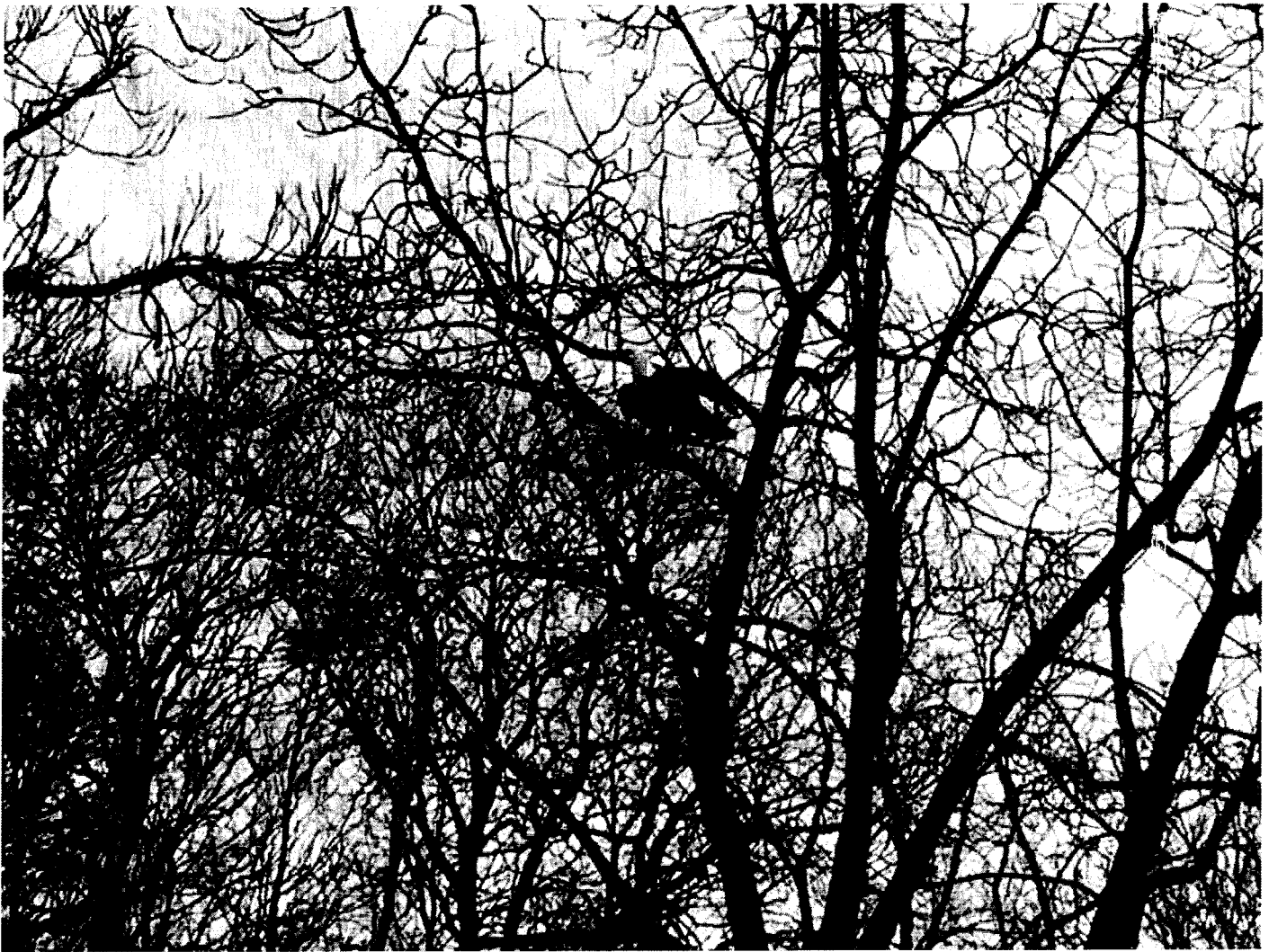
PICTURE OF AMERICAN BALD EAGLE FO PROPERTY AT 53 OLD POST ROAD.