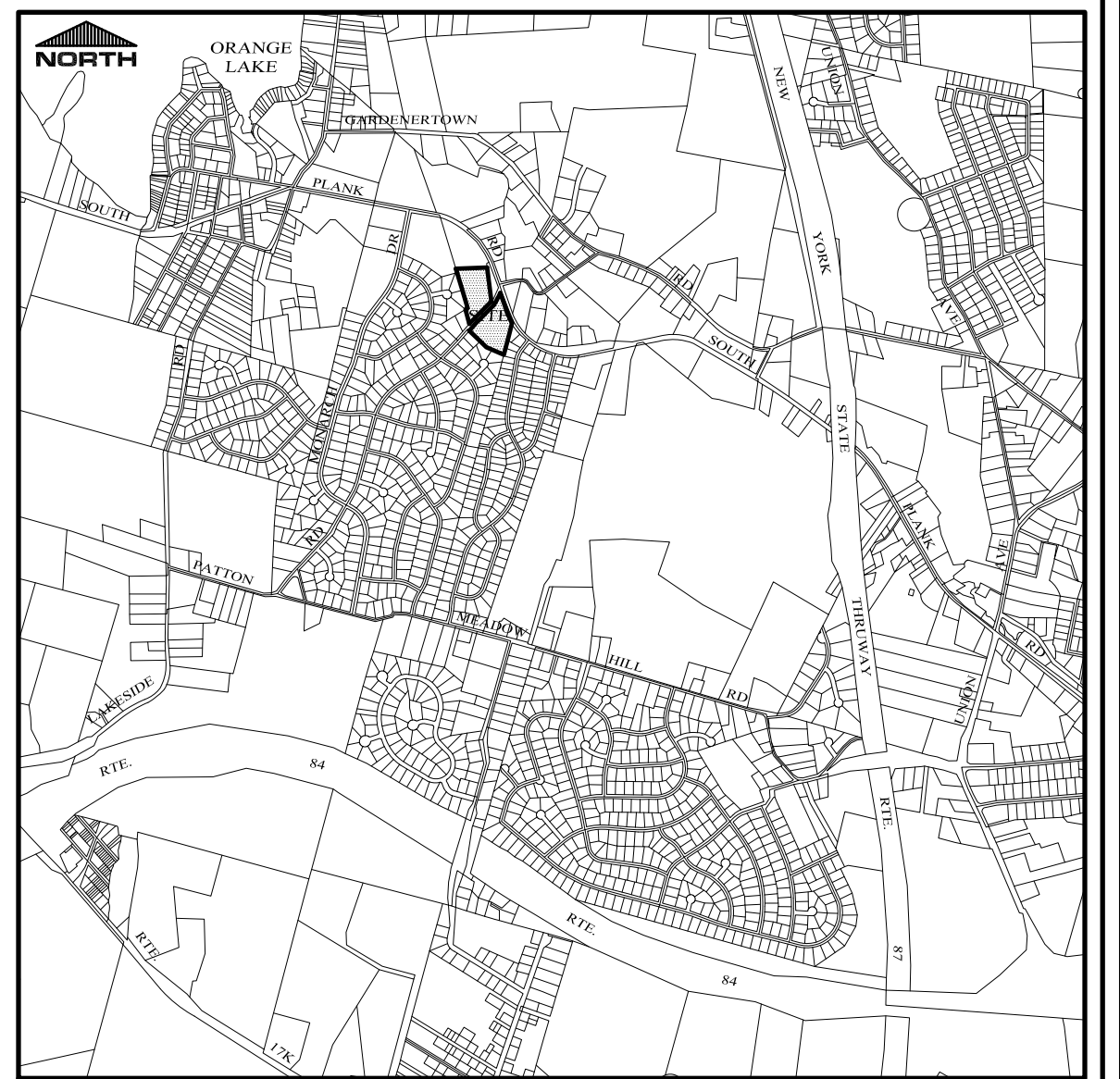
LOCATION MAP SCALE: 1" = 2,000'