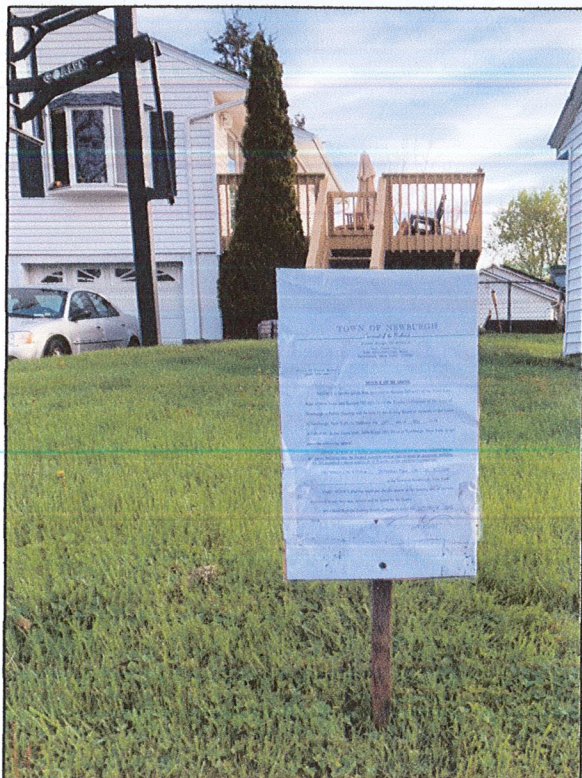
29 Paddock Place, Newburgh – Sign Posting