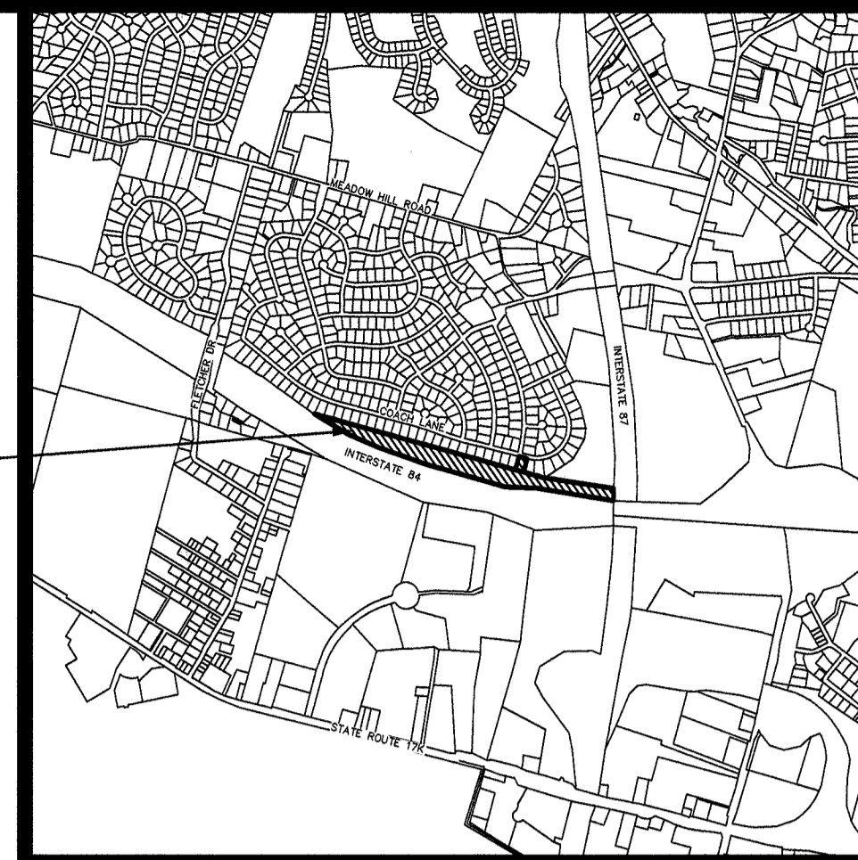
LOCATION PLAN 1 INCH = 2,000 FEET