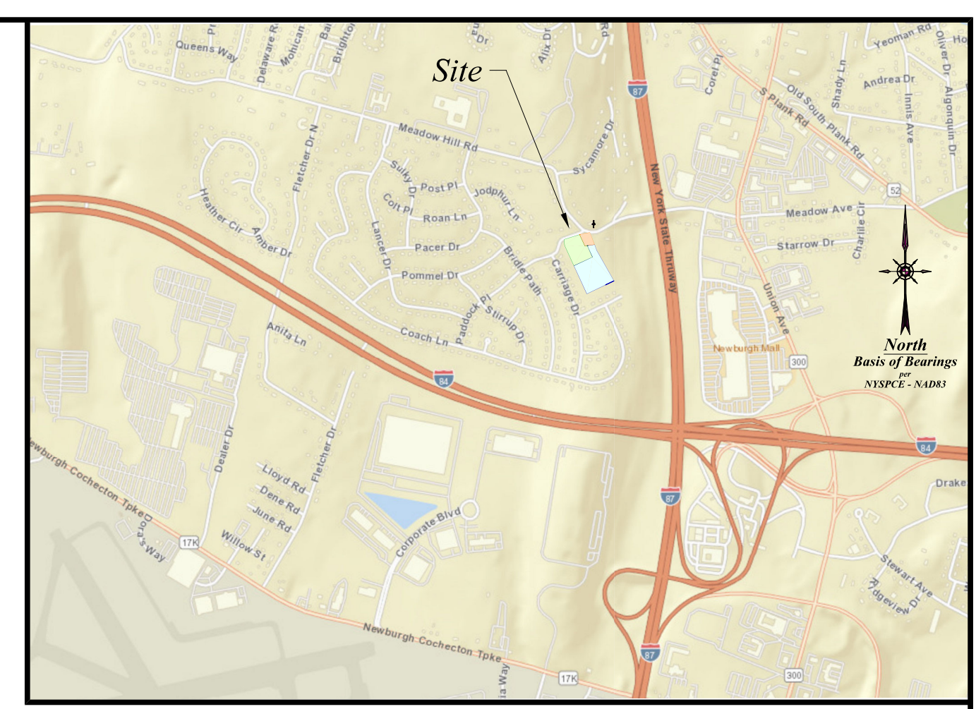
LOCATION MAP Scale: 1"=2000'

Parcel "B" Tax Map ID #: 58-4-16 Zone: R2, Res. 1 Paddock Place Lands of Mary Pietrogallo Liber 12889 at Page 1828 Existing Area 15,035.5 Sq. Ft. - 0.345 Acres Area To Be Conveyed to Parcel "B" from Parcel "A" 4,466.4 Sq. Ft. - 0.103 Acres New Area Parcel "B" Per Lot Line Change 19,501.9 Sq. Ft. - 0.448 Acres