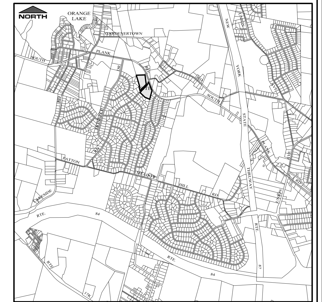
LOCATION MAP SCALE: 1" = 2,000'