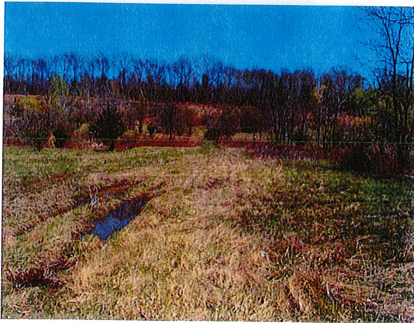
View of western portion of the Site.