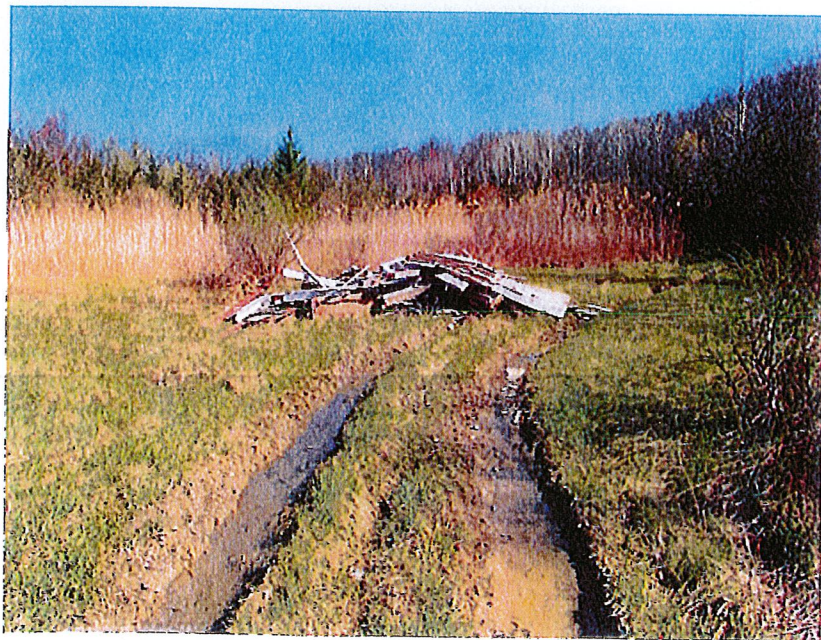
View along southern portion of the Site (along Route 17K).