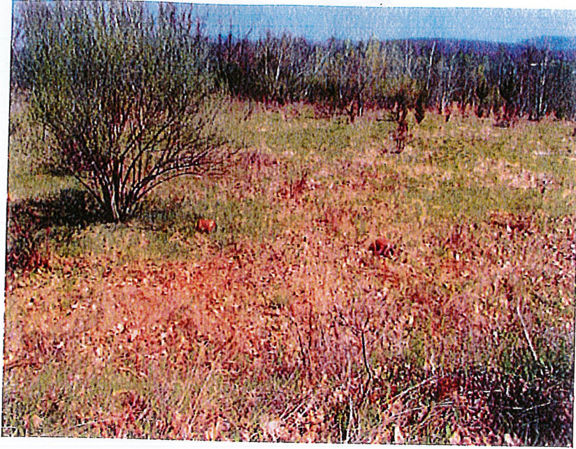
View of central portion of Site.