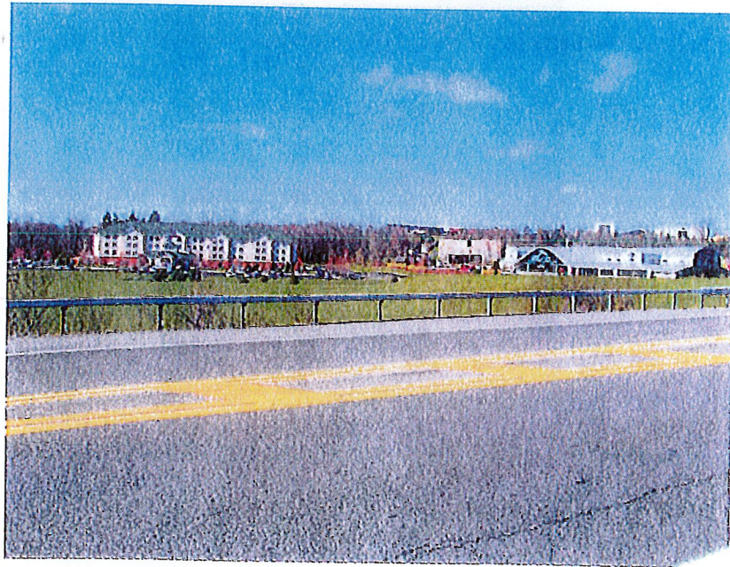
View of surrounding properties to the south, across Route 17K.