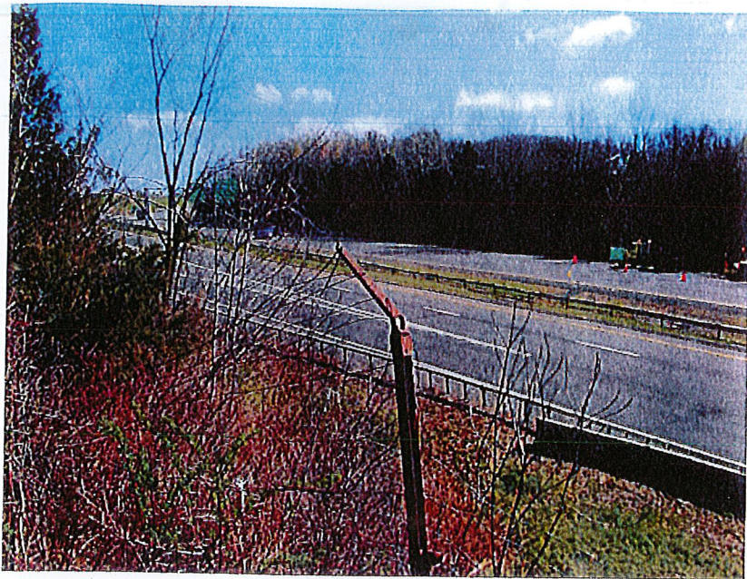
View of Route I-84 to the east.