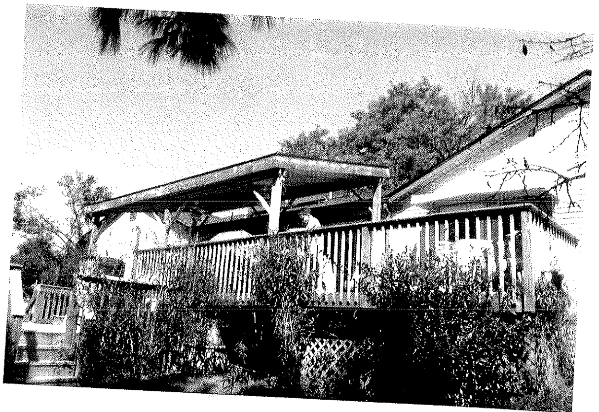
canopy 12 x 24