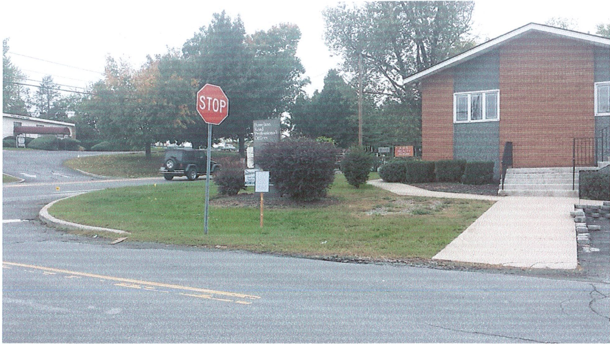
Sign #1 on Powelton Road