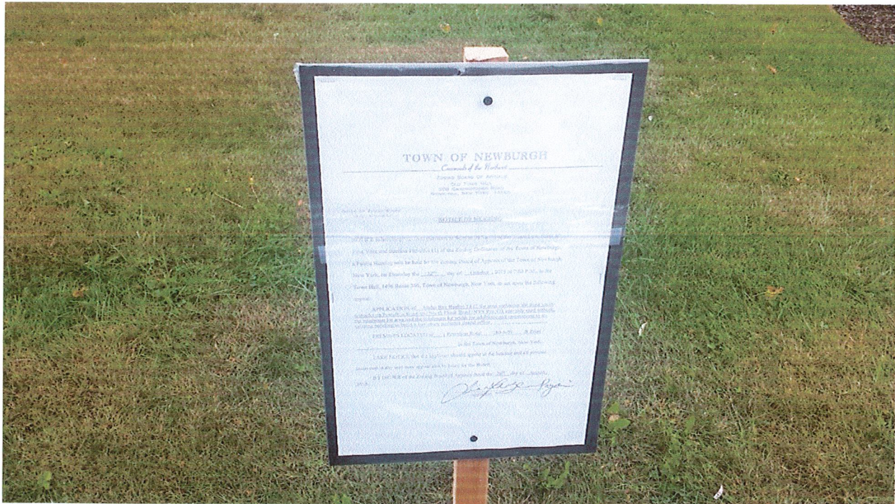
Enlarged picture of sign #2