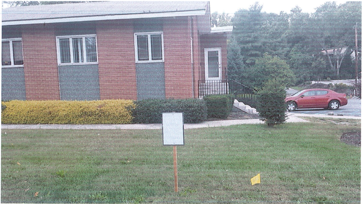
Sign #2 on North Plank Road