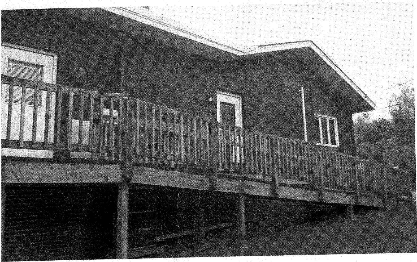
5 SITE PHOTO - WEST SIDE