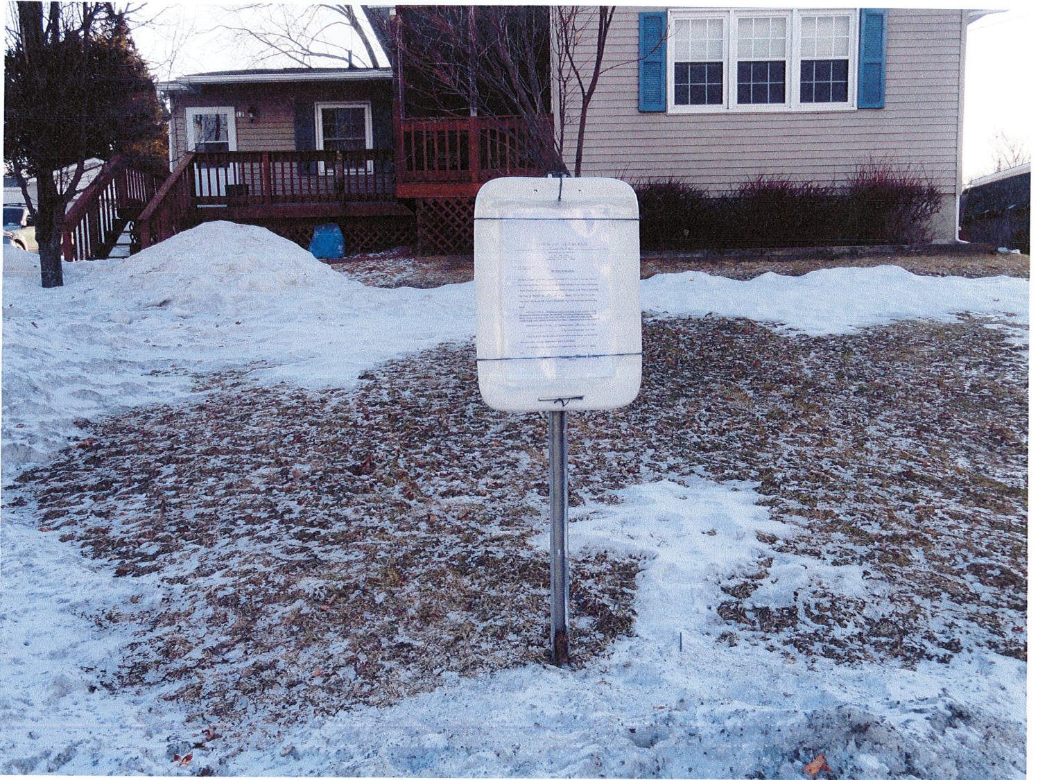
Lemunyan - 12 Fleetwood DK

TAKE NOTICE that the applicant should appear at the hearing and all persons