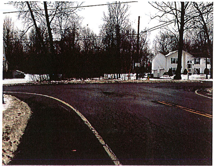
MEADOW HILL ROAD AT MONARCH DR.