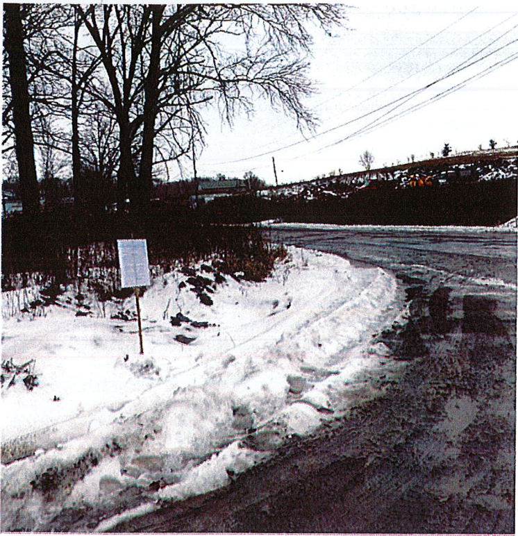
LAKE SIDE ROAD NEAR PROPERTY ENTRY