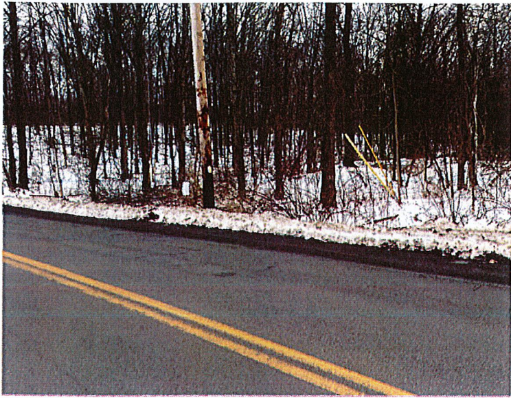
PATTOW ROAD AT BEND