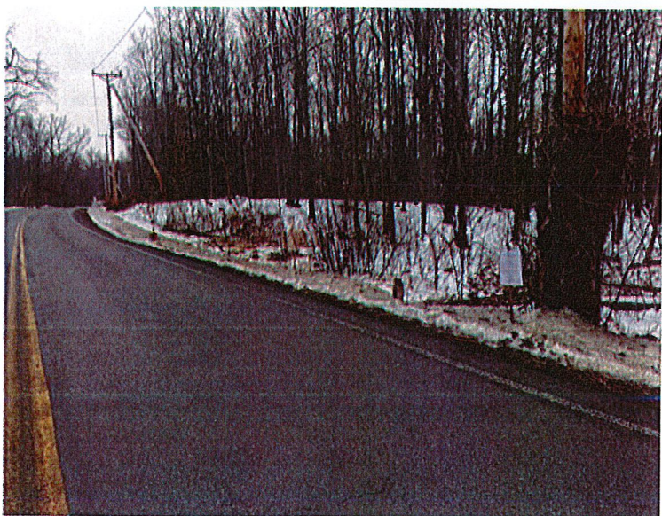
LAKESIDE ROAD NEAR ICE RINK