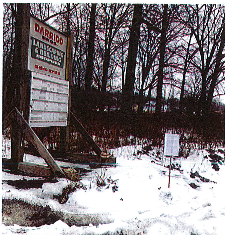
LAKESIDE ROAD C. PROPERTY ENTRANCE