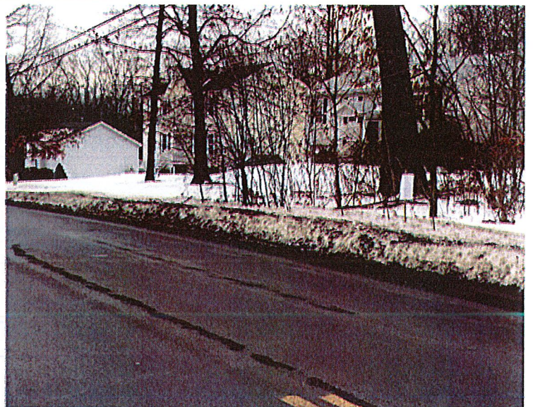
MEADOW HILL ROAD NEAR MONARCH DRIVE