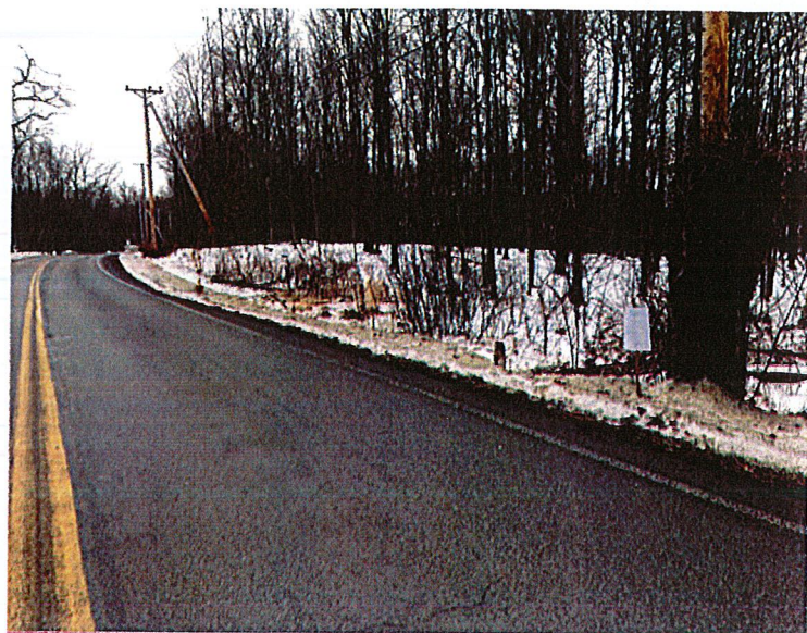
LAKESIDE ROAD NEAR ICE RINK