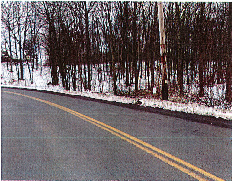
PATTON ROAD AT BEND