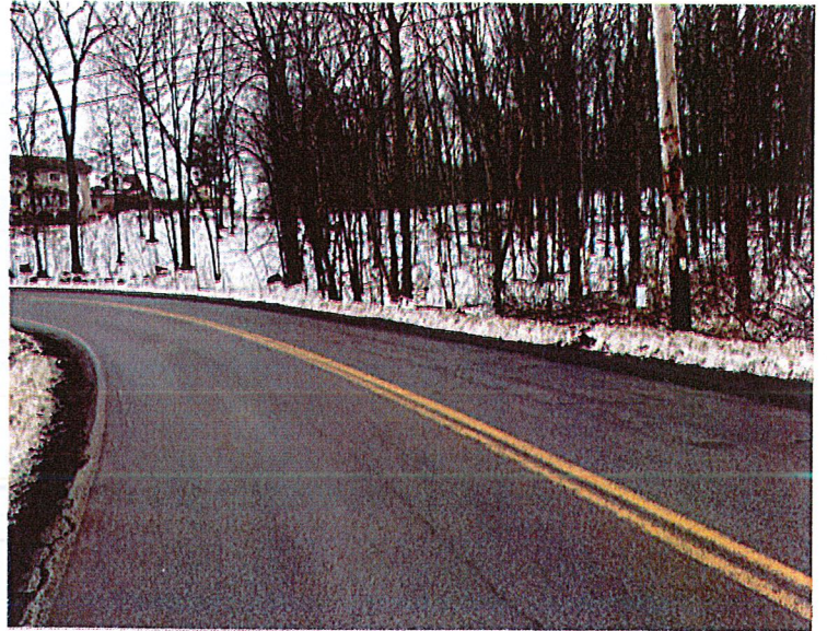
PATTON ROAD AT BEND