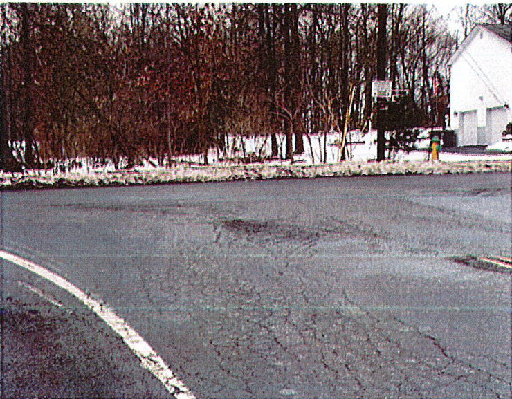
MEADOW HILL ROAD AT MONARCH DRIVE