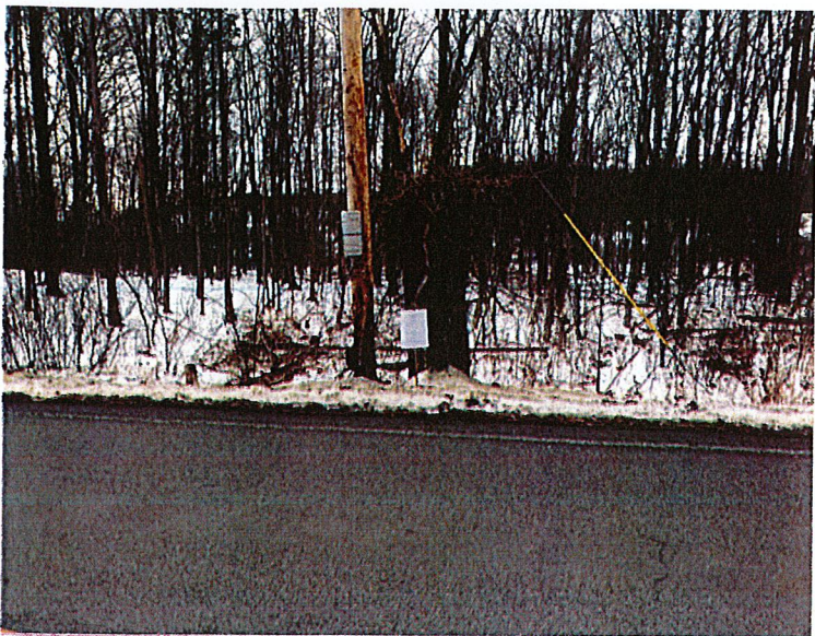
LAKESIDE ROAD NEAR ICE RINK