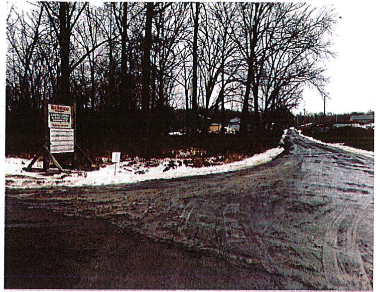
LAKE SIDE ROAD @ PROPERTY ENTRY