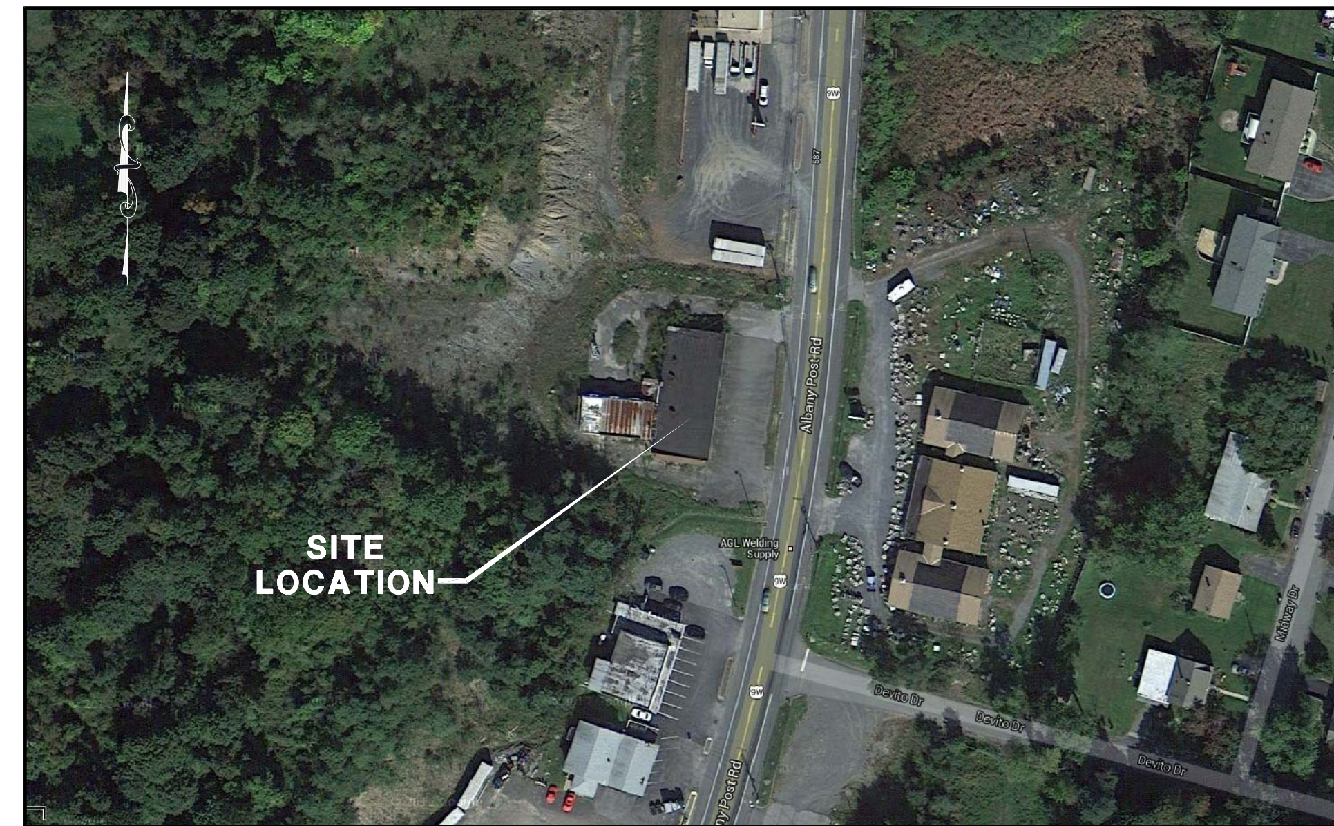
SITE AERIAL MAP SCALE: NTS