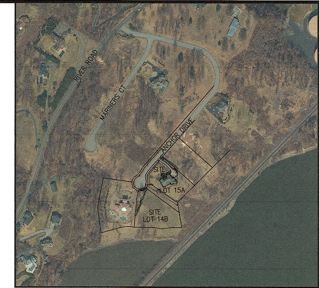
LOCATION MAP EXISTING SCALE: 1"=200'