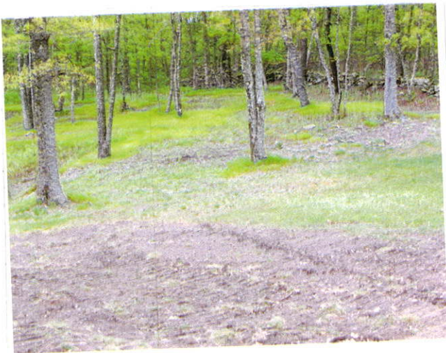
BACK YARD (East)