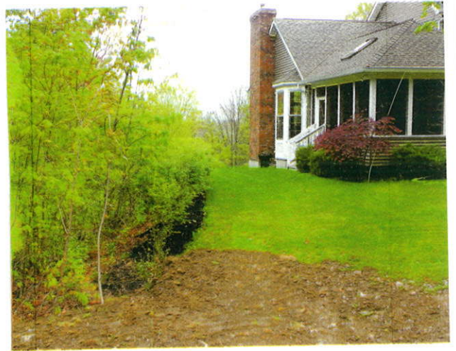
SIDE YARD (North)