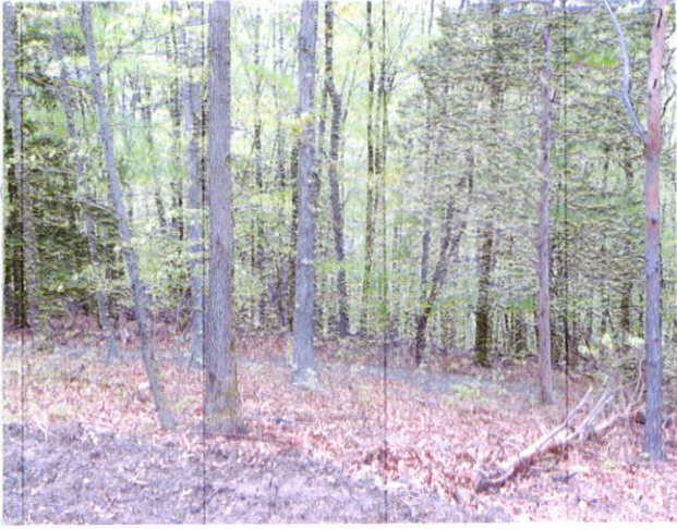
FRONT YARD (West)