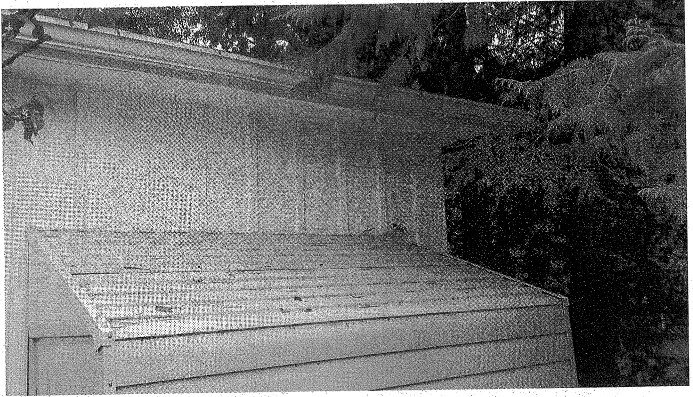
4 PHOTO 4 A-3 1/16" = 1'-0"