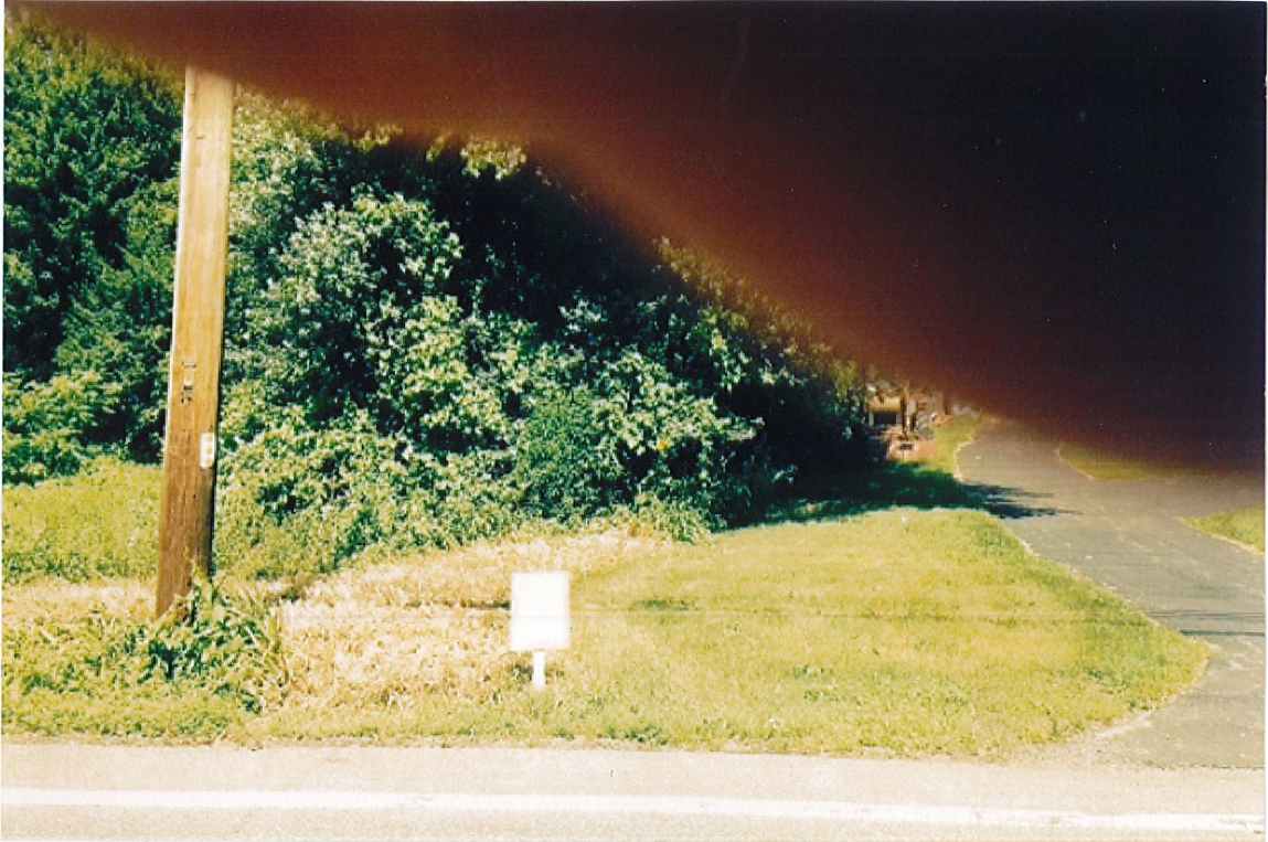
Use shall be deemed prohibited to keep food on the property

PREMISES LOCATED at 954 Route 32, Walkkill (S-3-8-11) R-1R Zone