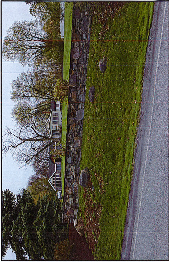
PROPOSED STREET VIEW "PROPOSED GARAGE NOT VISIBLE"