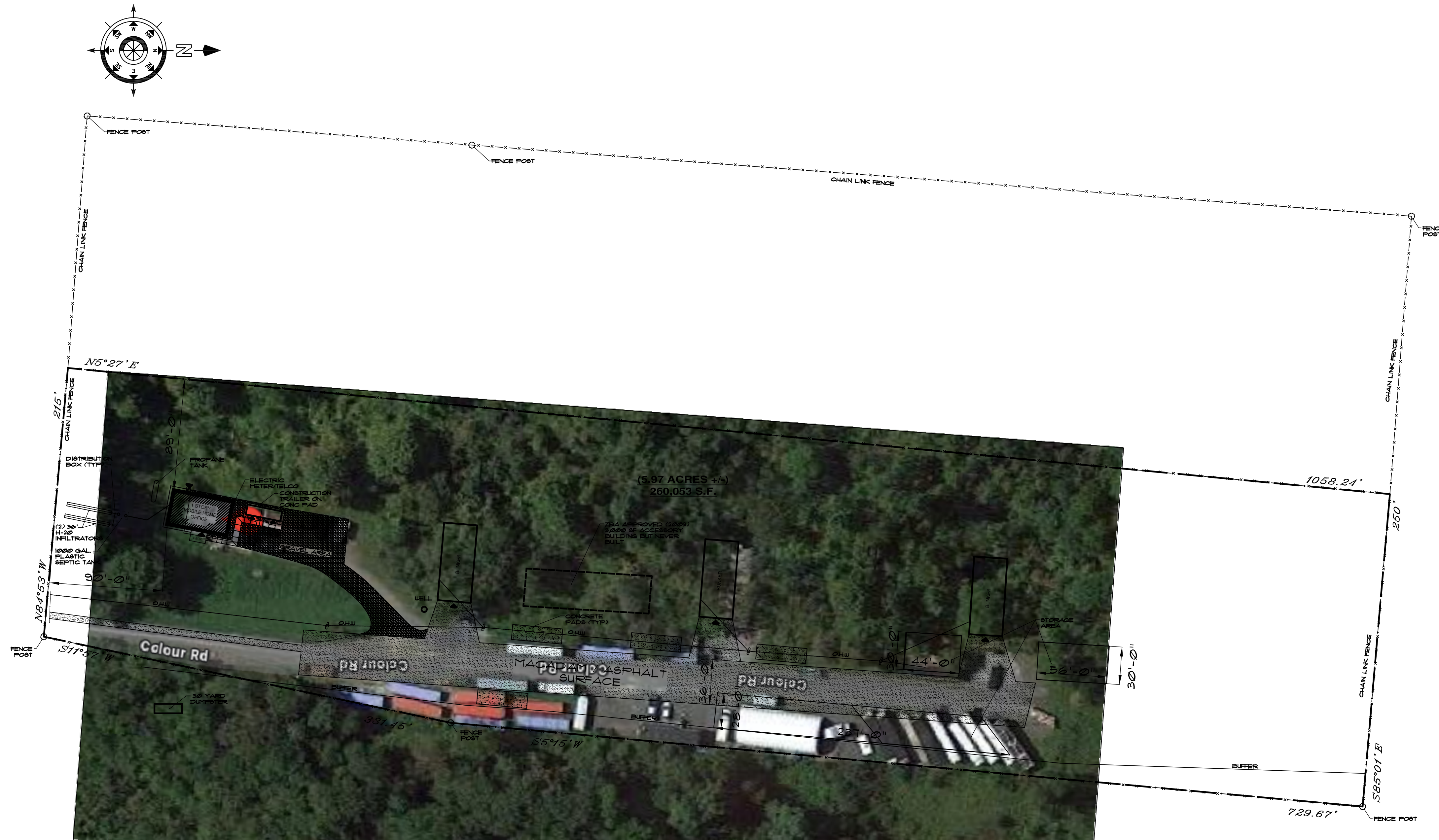
1 Historical Layout with Google Image S-2 Scale: 1" = 50'-0"